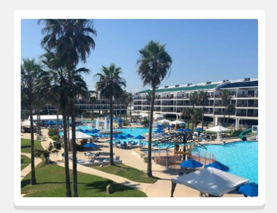
Port Royal 2 Bedroom Condo 4 Night Stay