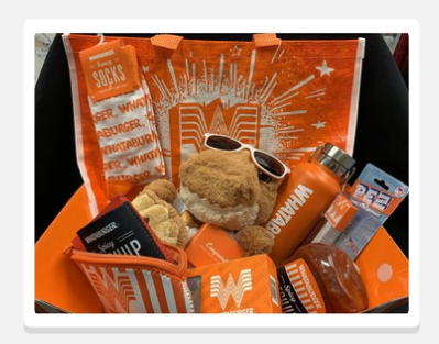
Whataburger for a Year