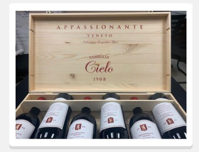
Appassionante Veneto (Six Wine Bottle) Gift Set